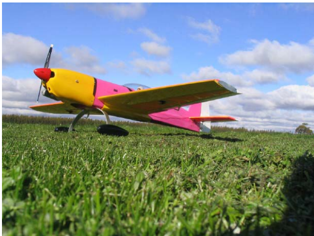
Russell's new Extra 300s just before its maiden flight. The color scheme certainly made it highly visible in the air.

Russell has been kind enough to provide some details on his new Extra shown below.