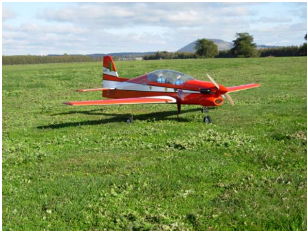
Another shot of Peter's new Tucano. Note Mt Buninyong in the background.

day. The Tucano is powered by an OS 46FX, which hauls it around the sky with ease.